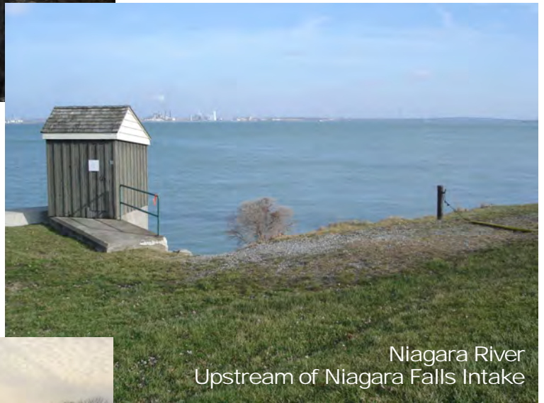
Niagara River Upstream of Niagara Falls Intake