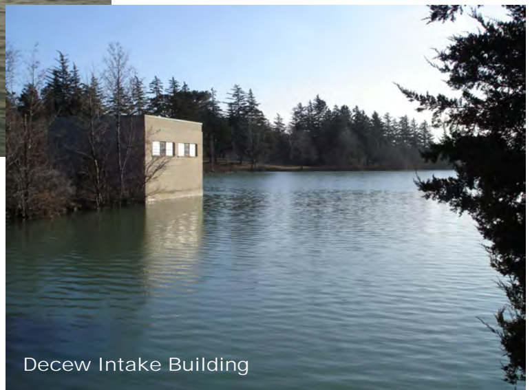
Decew Intake Building