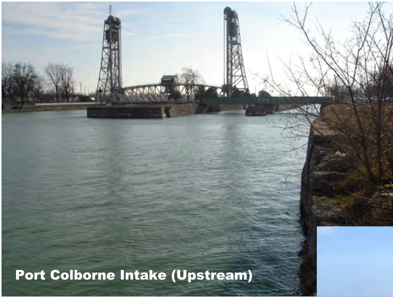
Port Colborne Intake (Upstream)